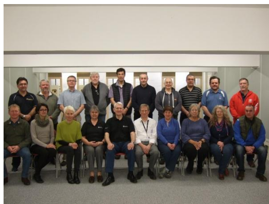
Successful students that attended the ISSF Rifle Judges course.

Future dates: next full training weekend 16/17 April Home Countries International 14/15th May