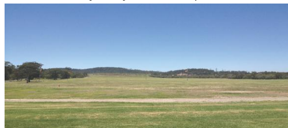
Belmont Range at Brisbane (Gold Coast)

Build of new facilities is reported on schedule