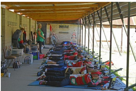
Tondu Full Firing point